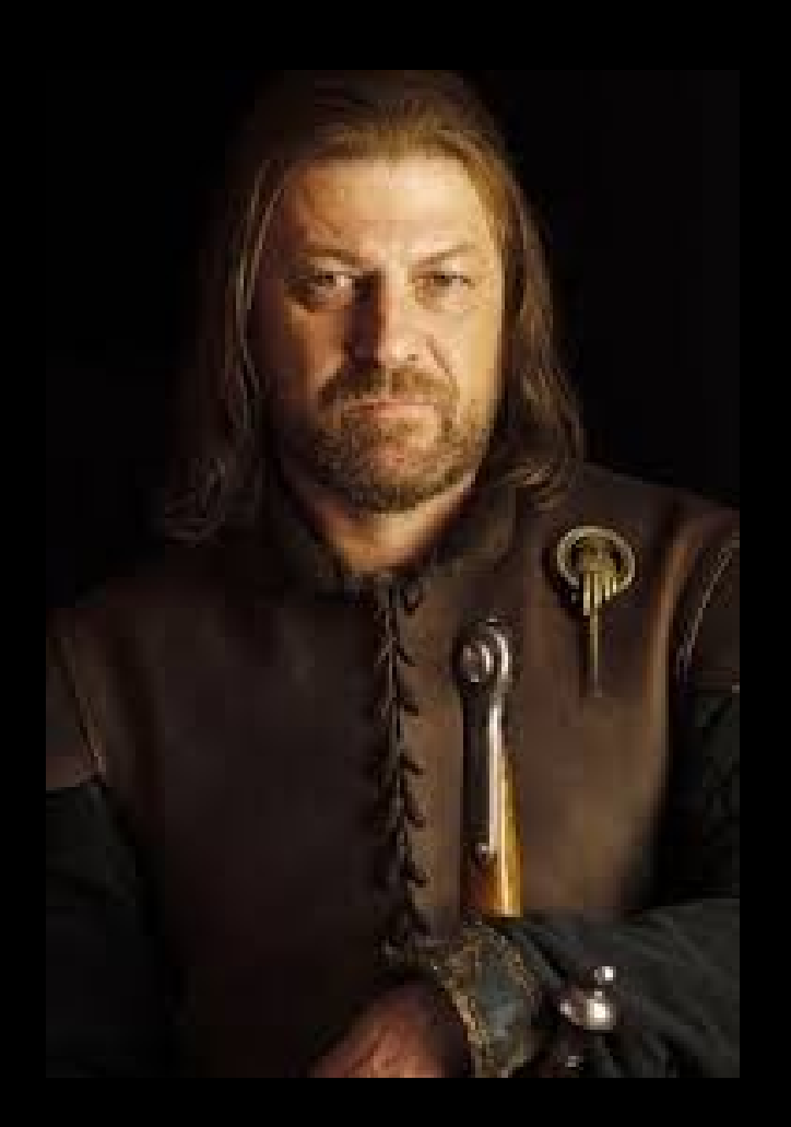
Y: Eddard Stark